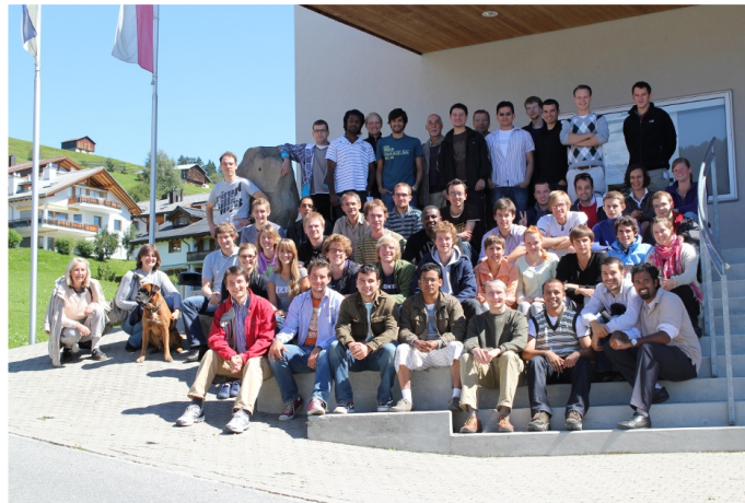
Participants of the ISU energy 2010

Institute of Energy Systems and Fluid-Engineering Technikumstrasse 9 CH-8400 Winterthur