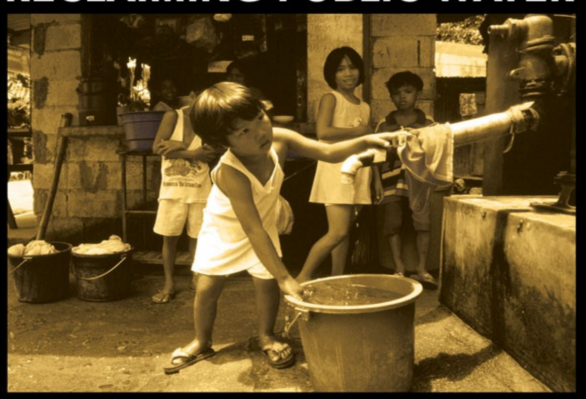
Achievements, struggles and visions from around the world