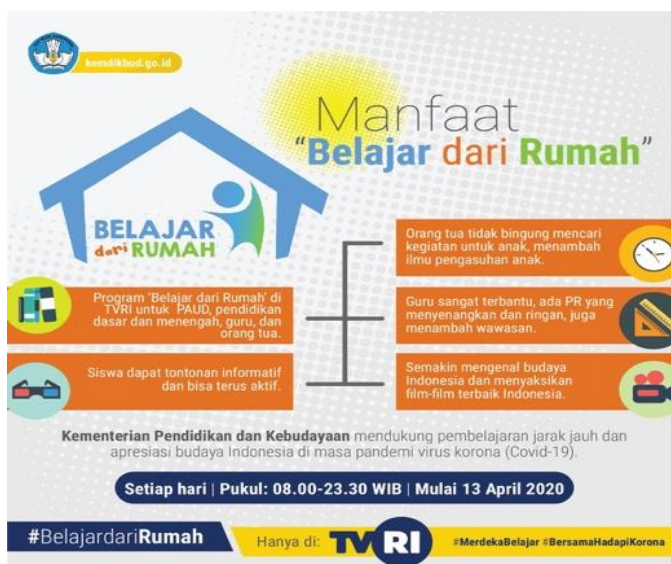
Figure 1. Online Learning Platform by the Ministry of Education and Culture, Indonesia through TVRI.

The continuity of the learning process has been pursued all over the world. In Indonesia, through Circular Publication Number 4 of 2020 concerning the Implementation of Education Policies in an Emergency Situation as the cause of Covid-19 Spread, learning at home is adjusted to the talents and interests of children. The CNN Indonesia (2020) has reported that the Ministry of Education and Culture of the Republic of Indonesia (KEMENDIKBUD) has provided several programs such as Home Learning to Learning from Home on TVRI and RRI to support students' learning process in every level of education.