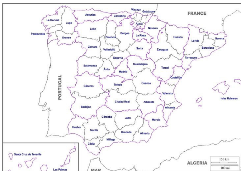
Figure 2. Name and location of the Spanish provinces.

The national unemployment rate is also considered from the same survey to be treated as a common factor in the model, following Bailey et al. (2016). The study covers from the first quarter of 2002 to the last quarterly data available at the time of carrying out the study (fourth quarter of 2023). So, we are considering 4,224 observations in the panel (88 temporal units and 48 spatial units). This length of the panel gives robustness to our results since we have a sufficiently large sample at the temporal and spatial levels. Also, using quarterly data we are properly capturing the sensitivity of the seasonal variation of the data.