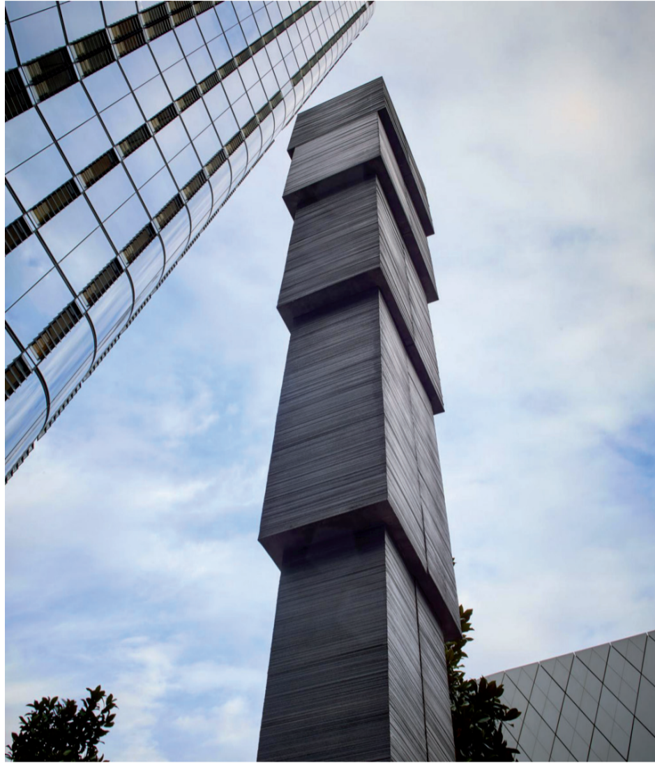
Figure 5. Idris Khan, 65000 photographs , 2019.