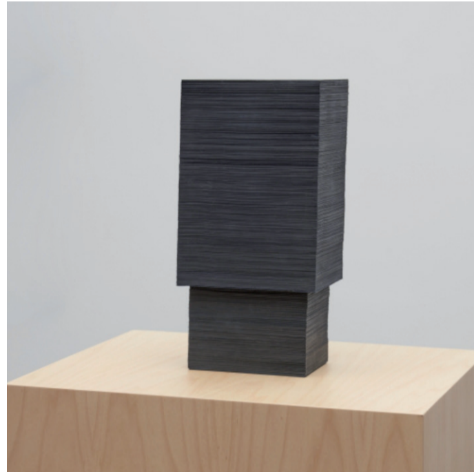
Figure 3. Idris Khan, My Mother , 2019. © Sean Kelly Gallery.

very act of photographing the dead. But what is it that photography promises to restore, to bring back? South-Korean born philosopher Byung-Chul Han argues that the medium not only offers a visual testimony of the dead but also allows experiencing them as if alive once again: “La fotografía no se limita a recordar a los muertos. Más bien, hace posible una experiencia de su presencia devolviéndoles a la vida” 26 . Analogously, Barthes considered photography to be a means of resurrection 27 . Taking up this idea, Han claims that a photographic image is the umbilical cord that connects the beloved body to the one who is looking beyond death, redeeming it from decomposition 28 . Thus, the experience of human life brevity is reinforced by photography.