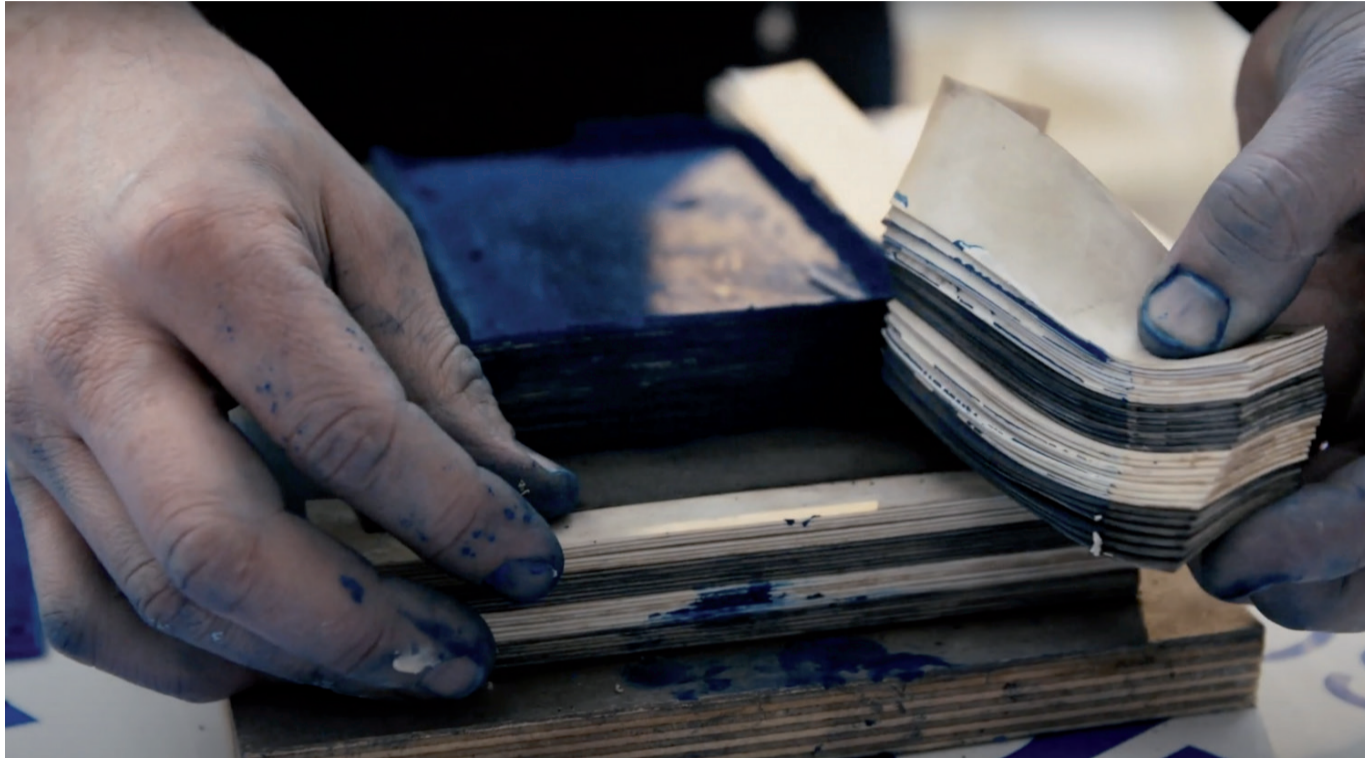
Figure 4. Idris Khan, My Mother (detail of the production), 2019.

and I was thirty, recently married and about to start a family. Nine months later grief struck again when my wife had a stillbirth very late into her pregnancy. I responded to the anger of all of this in the only way I could, by making art" 29 .