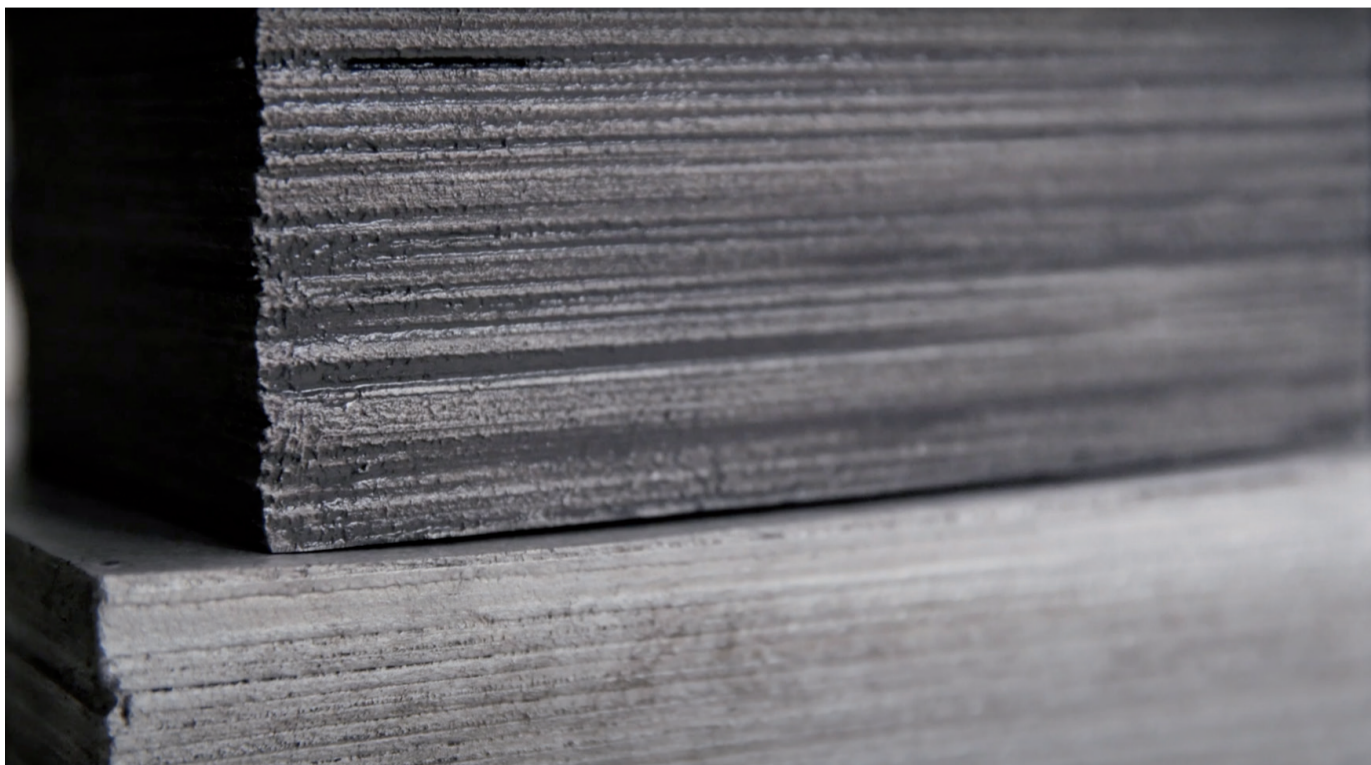
Figure 6. Idris Khan, 65000 photographs (detail), 2019.