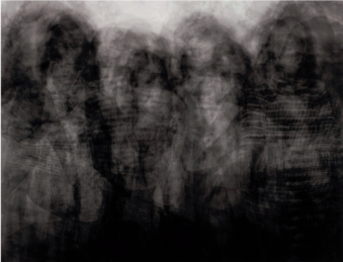
Figure 2. Idris Khan, Every... Nicholas Nixon's Brown Sisters, 2004.

aging. By superposing Nixon's photographs (from over 20 years by the time the work was made), Khan condenses all those years and lives into a single moment. The sisters' faces are no longer recognizable: their figures have become stain, blur, air. "In Khan's composite, the sitters appear to turn to stone. They have become monumental, sepulchral, and eternally petrified" 12 .